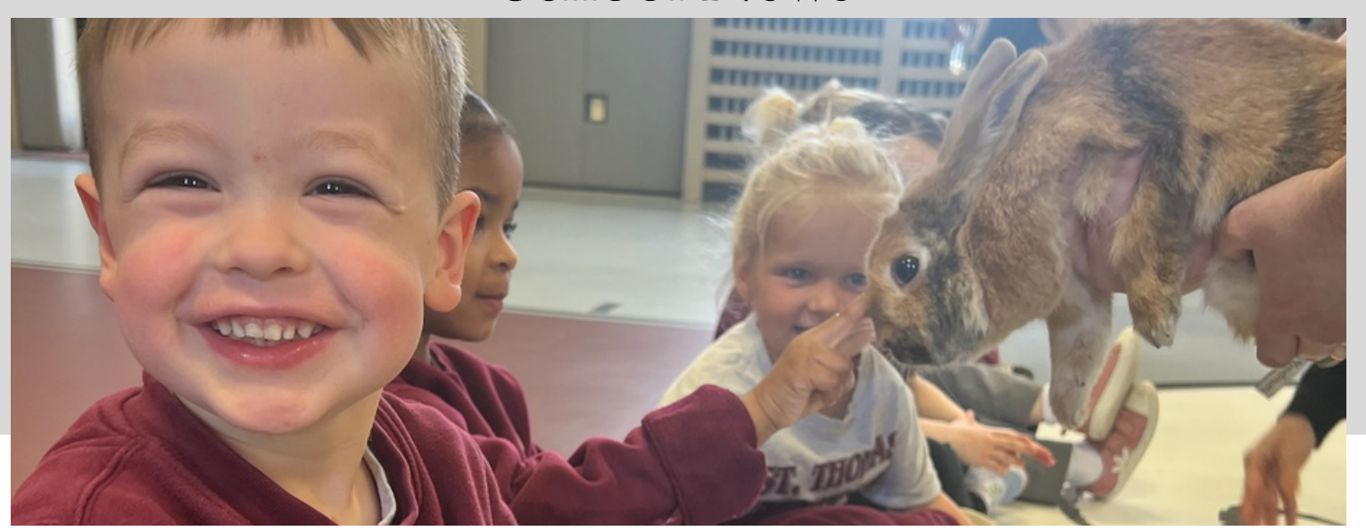
Pre-K3 and Pre-K4 had an exciting day yesterday exploring the wonders of 'fur and feathers during their visit from 4-H Education Center at Auerfarm yesterday. They could control their excitement as they petted rabbits and looked at different birds' feathers!