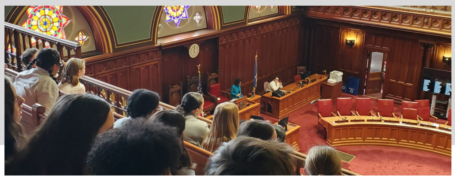
We are proud of our St. Timothy Honors Choir for their performance at the State Capitol and for representing our school so well.