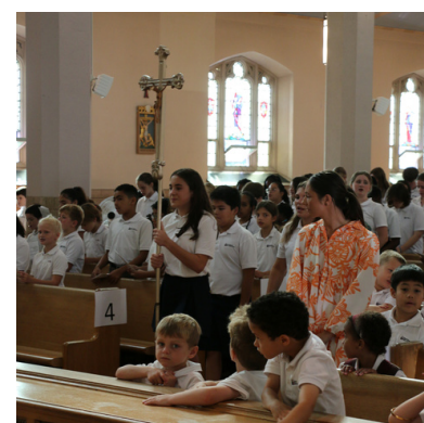
St. Timothy Middle School students set a wonderful example today during our first All School Mass. Thank you all!