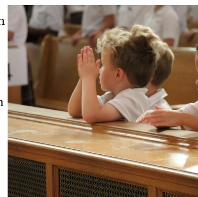
Kindergarten did a great job during today's mass. They knew all their prayers and sang along with the rest of the school. We are looking forward to more All School Masses this year!