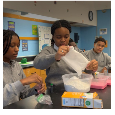
Hands on learning happening in 8th grade science!