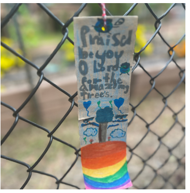
4th grade students decorated the community garden at St. Thomas with their beautiful artwork from their retreat this week.