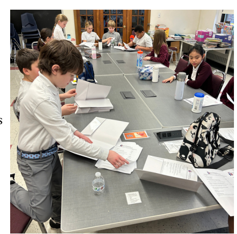
Student Ambassadors are busy at work, prepping for the upcoming Open House!

Foundation for the Advancement of Catholic Schools (FACS): Reminder - all applications must be completed and submitted to the school office by Monday, March 4th. The Scholarship Application, Guidelines and Criteria for each of the 2024-2025 scholarships is available on our website. Please click here to begin your review. Please indicate the scholarship(s) you are applying for on page 5 of your application.